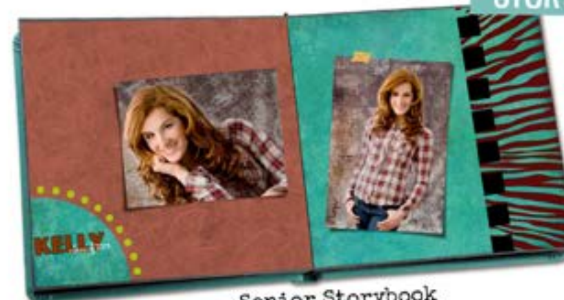
Senior Storybook {your words, your images, your story} The ultimate in senior expression!

You'll see up to 100 originals. We only offer 8 of these sessions a year.