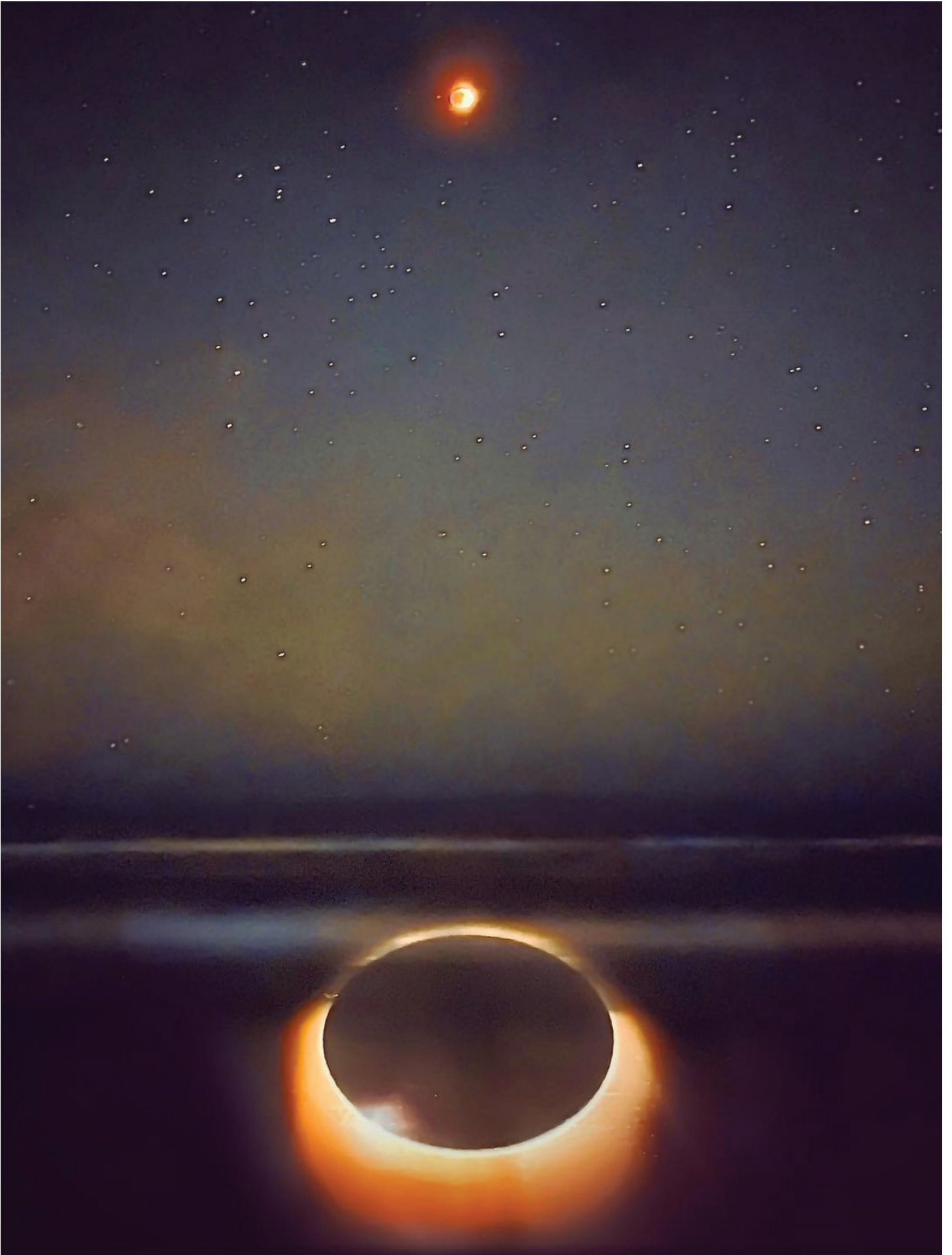
Robin Vuchnich, Surf Projection Series, Photography & Site-Specific Light Art, NC Outer Banks