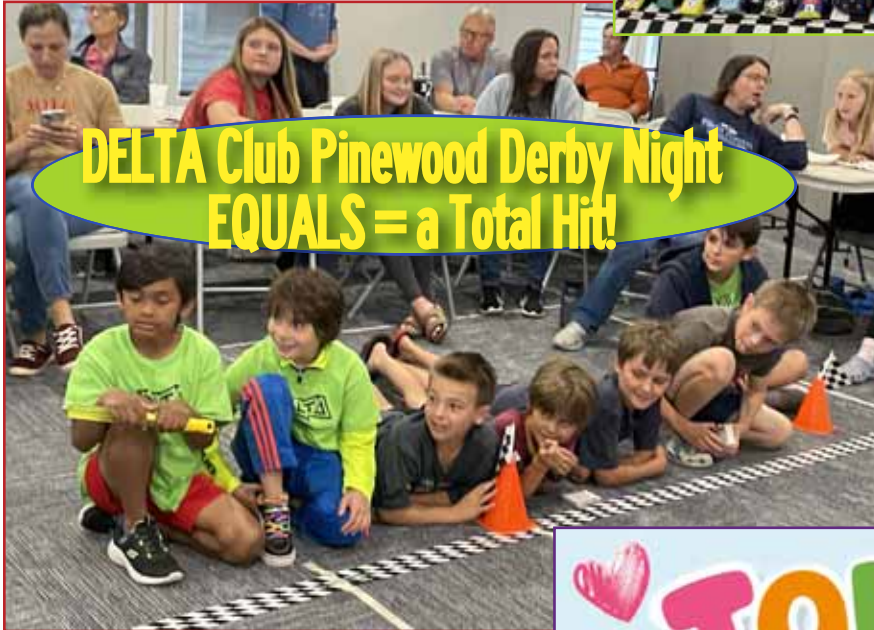
DELTA Club Pinewood Derby Night EQUALS = a Total Hit!